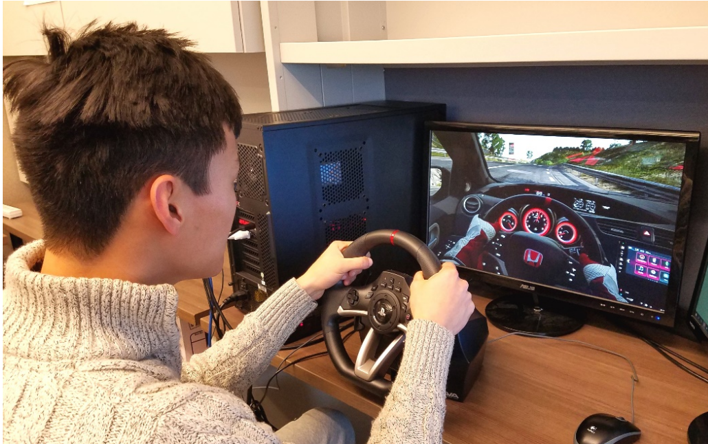
Figure 2. A participant undertaking the experiment.

After participants felt comfortable using the system, the simulation was reset and task instructions were given. Participants were told to drive normally on the correct side of the road while maintaining a driving speed between 50 mph (88 kph) and 60 mph (96 kph). They were also instructed to stay within the designated lane and that deviating from the lane would count as a driving error. Emphasis was placed on driving safely as they would in the real world and that all tasks must be completed before the course ended reaching the end of the road within the simulation.